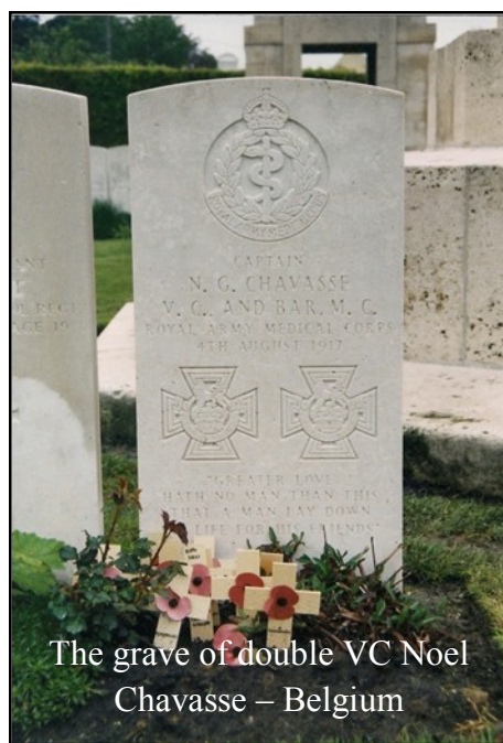
The grave of double VC Noel Chavasse – Belgium