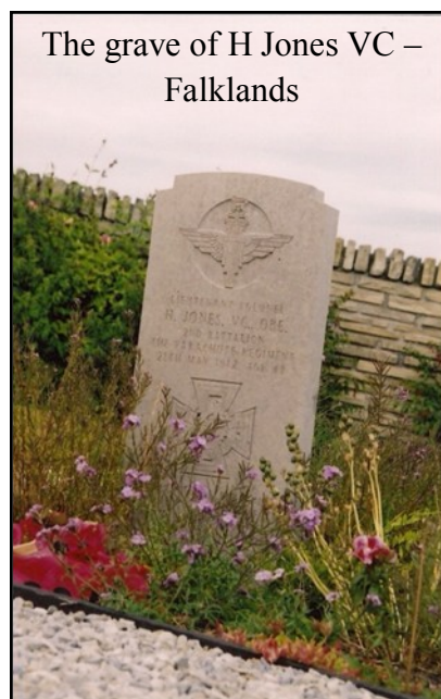
The grave of H Jones VC – Falklands