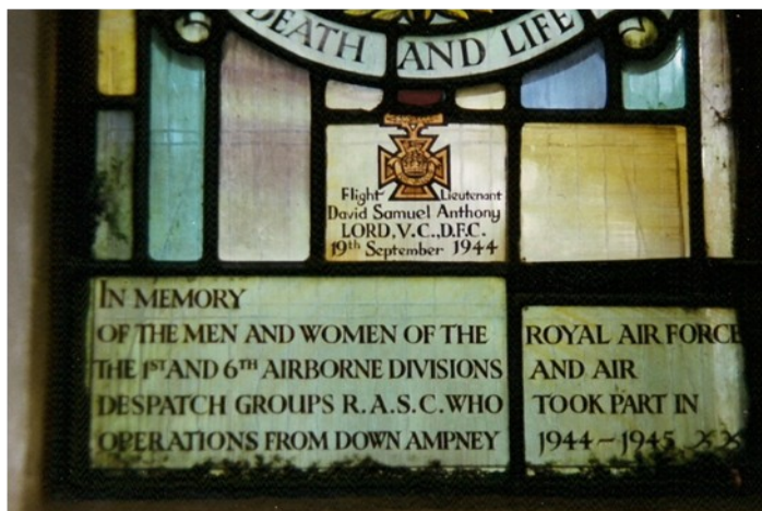
Memorial window recognising David Lord VC DFC

Below are a selection of photos, just a few of many thousands which illustrate my work.